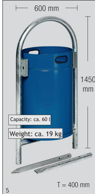
Pic.: RB005, to embed in concrete, corpus blue, Art.-No. 3010