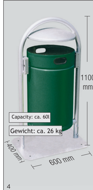
Pic.: RB006, with bottom plate, corpus green coated, Art.-No. 3023