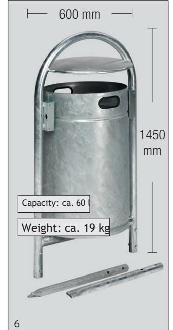
Pic.: RB007, to embed in concrete, corpus hot-galvanized, Art.-No. 3032

All models are equipped with a triangular lock. The corpuses with 60 l capacity are either made of elo.-galvanized steel sheets and powder coated or completely hot-galvanized. The pipe bend with bottom plate and the pipe bend stands to embed in concrete are completely hot-galvanized.