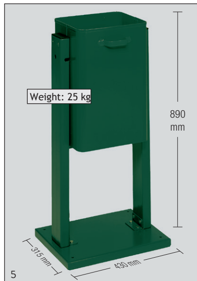
Pic.: Art.-No. 16552

The container have a capacity of ca. 40 l. Equipped with a triangular lock. A key as well as the necessary fitting material are included in the delivery.