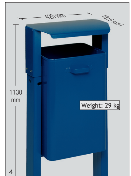
Pic.: Art.-No. 16540