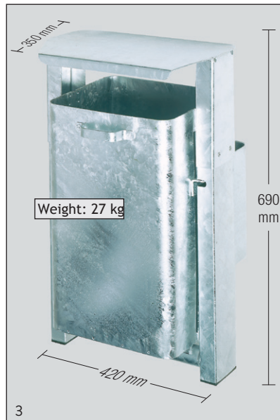
Pic.: Art.-No. 16521